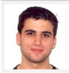
PIC, Barcelona - Spain

I am currently working as Network administrator and dCache (MSS) Manager at PIC, as member of the Spanish Tier1 team. As a computer engineer, my role at PIC focuses on data flow optimization between PIC's Storage Element and Computing Element and among LCG's sites, including Tier0-Tier1 data acquisition over the LHCOPN. I am also working in the SRM v2.2 deployment and have experience administrating Linux, Solaris and Windows servers.